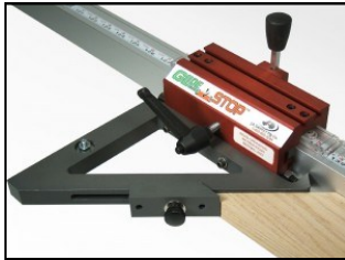
Miter Fence Part# GS111