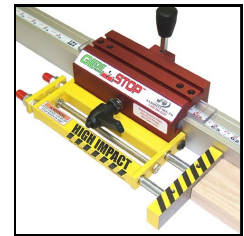
High Impact Part# GS119