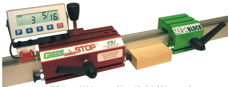
GlideStop, GS2 Fence and Zero Block Sold Separately

Adding a Digital Measuring Accessory to your GlideStop is an excellent way to increase the accuracy of your operation and alleviate tape reading errors.