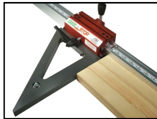
Gang Fence Part# GS112