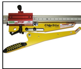
ChopStix Part# GS118