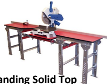
Free Standing Solid Top